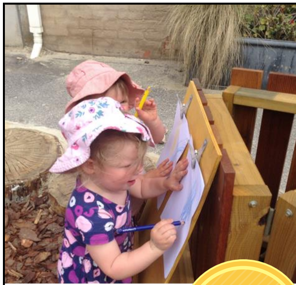
The Toddlers enjoying the new front yard at the ITC